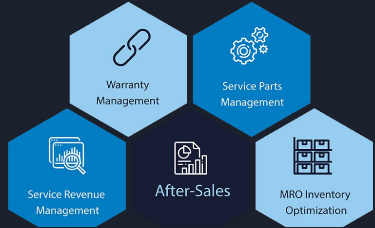
Simple service center scheme