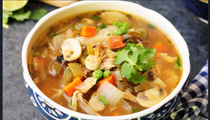
Adaptation of recipes to cook in device